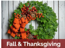
Fall & Thanksgiving